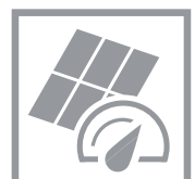
High module conversion efficiency