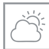
Excellent low light performance