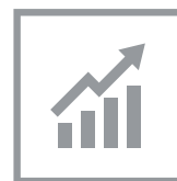
Plant optimization and yield increase